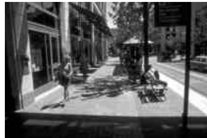
An attractive, walkable town center is key to a community's sense of identity.