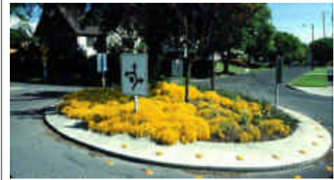
Gateways should express community pride and promote traffic safety.