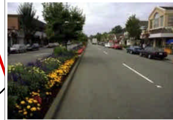
Roads should accommodate cars and pedestrians. Sidewalks separated from the street with attractive landscaping encourage walking and bicycling, provide safe access for persons with disabilities, and foster thriving business areas.