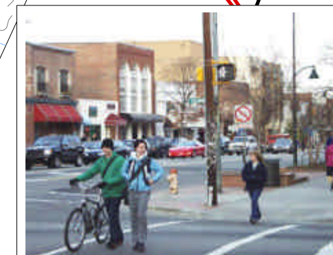
Raised crosswalks promote safety, slow traffic.